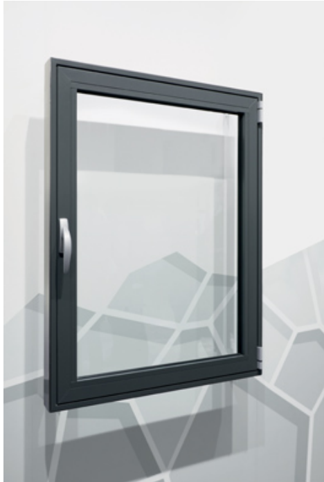
Overall view of a window design with “Roto AL 300” for profile systems with integrated offset edge