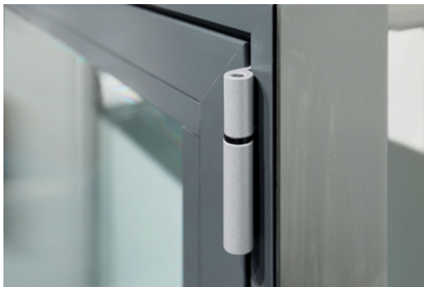
“Roto AL 300” stay hinge and stay bearing for profile systems with integrated offset edge