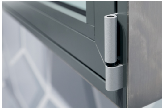
“Roto AL 300” pivot rest and corner hinge for profile systems with integrated offset edge